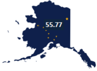
Overall School Index Value