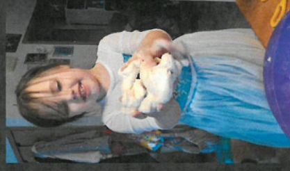
Fry Bread Zoom