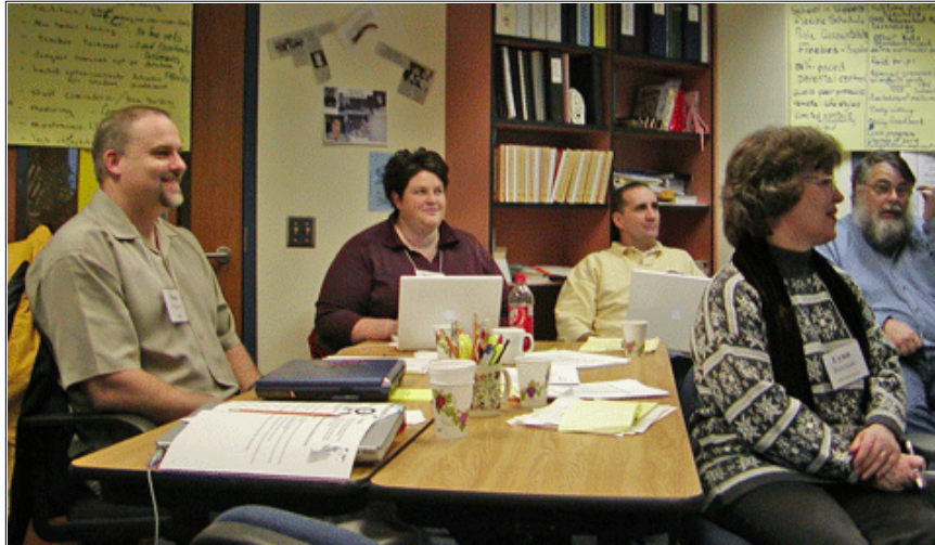
Southeast Island Strategic Plan meeting