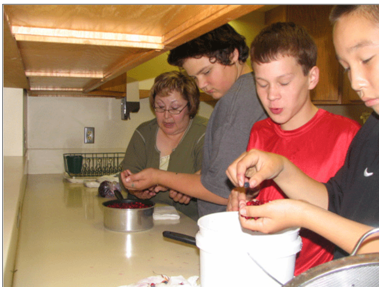
ICE Berry picking activity in Dillingham

QS2 partner districts enjoy a close alliance with AASB's federal grant Alaska's Initiative for Community Engagement. This initiative provides the support and resources to give Alaskans, at the local level, the information, tools, and assistance to work collectively in preparing Alaska's youth for the future. An Alaska ICE staff liaison is assigned to each QS2 partner district to directly support families, communities, and various other school constituencies to promote measurable increases in healthy behaviors and a reduction in the number of Alaskan youth who engage in unhealthy behaviors. It is AASB's strong belief that reduction in risky behaviors will lead to higher numbers of students demonstrating proficiency on required state academic assessments. The overarching approach is one of building on a community and school's strengths and growing additional supports for youth.