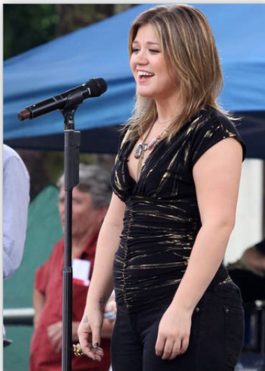
Kelly Clarkson in real life, singing on Good Morning America

List the kinds of products you think this magazine will advertise: