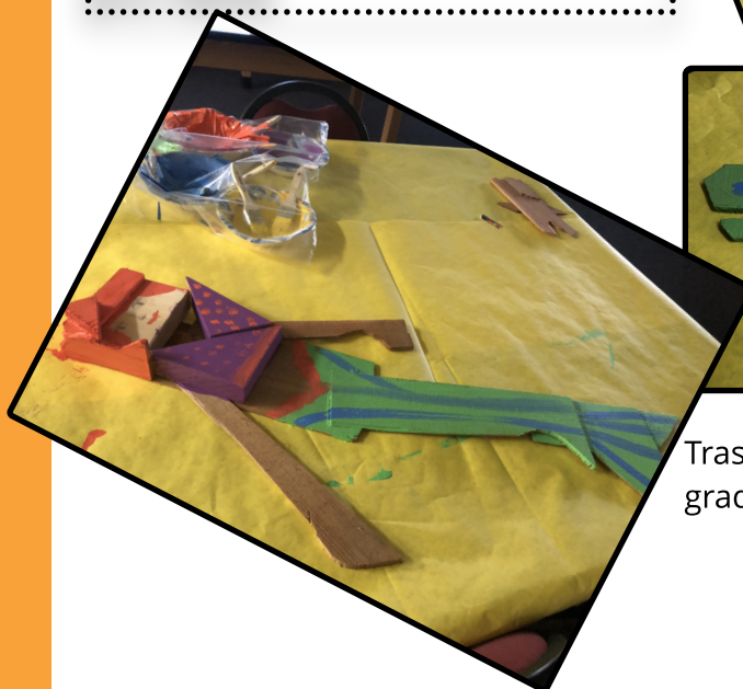
Trash art painted fish by grades 4 & 5