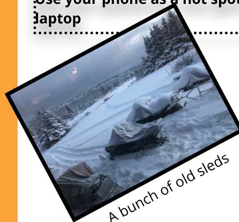
A bunch of old sleds

Use your phone as a hot spot for your laptop