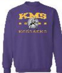
Crewneck Pullover Sweatshirt