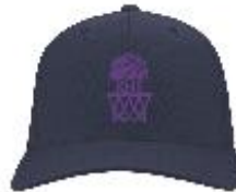
Dry Zone Nylon Cap