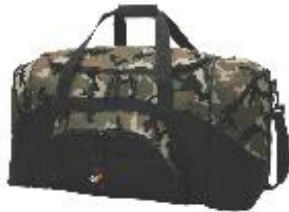
Colorblock Sport Duffel