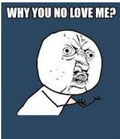
When the track coaches sign you up for the 1600