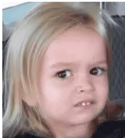
When your teacher tells you to stop talking even though you weren't