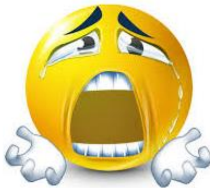
Me when I break my 2-year mewing streak