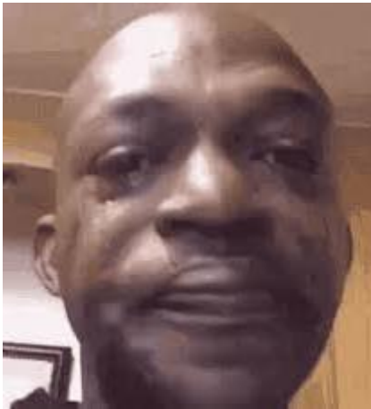
Me at 8th grade Farewell