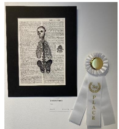
"Sister" by Ling Ling Theron