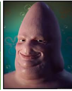
school picture day