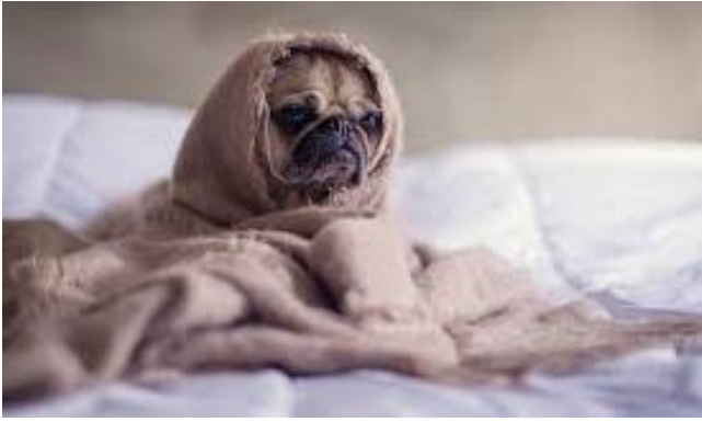
POV: school just got out on Friday and I will not be seen until Monday