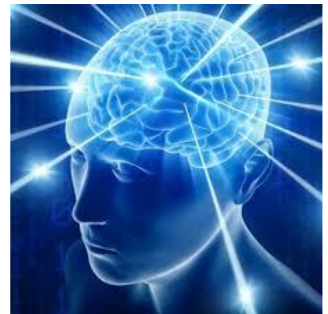
Me when I finally prove I'm not a robot by clicking on 27 bikes