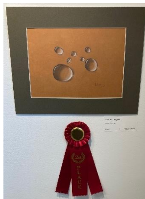
"Water Droplets" by Axel Washington