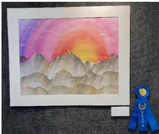
"Midnight Sun" by Greysen Besse