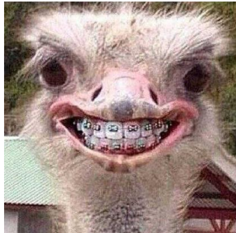
POV me when the teacher rewards the class with gum

Practice writing your name here in microscopic cursive!