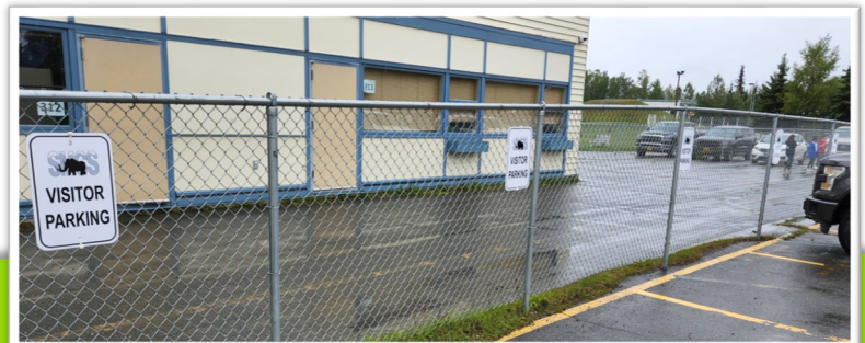
Image Info: SMCS Visitor Parking signs posted in our back lot. Access to the lot is across from the Post Office right next to the ice rink.

We have been able to use this with some of our parents already and have found it to be helpful. It is a change, and change is hard, but I know it will become natural in time.