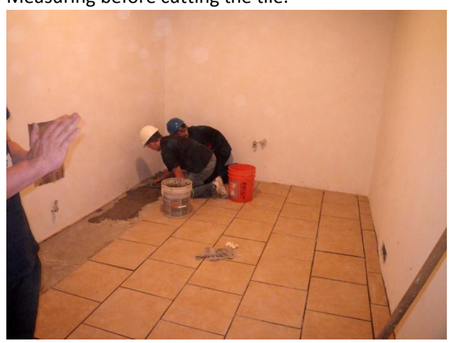
Installing the floor.