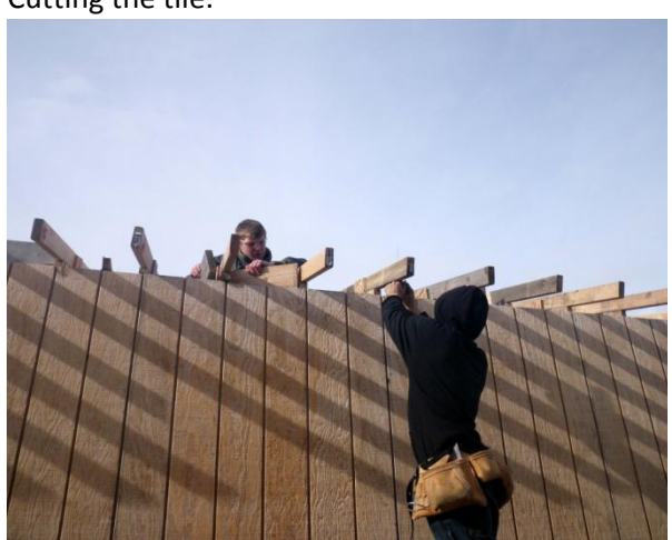
Putting the block.