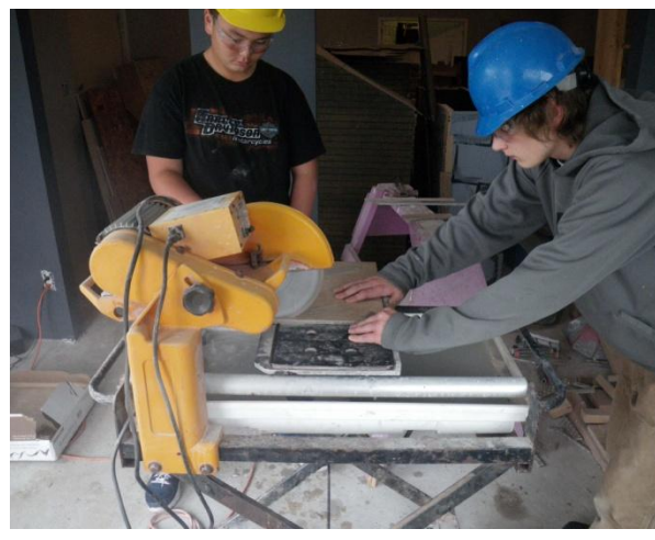
Cutting the tile.