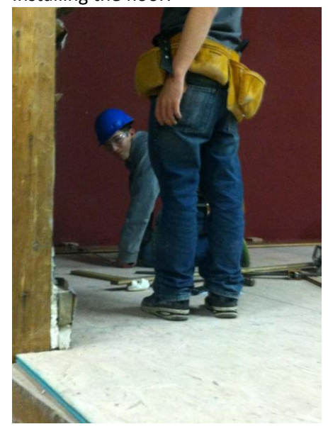
Installing a hard wood floor

Funds for the Alaska Construction Academies are provided to the Construction Education Foundation by grants from the Alaska Department of Labor and Workforce Development and the Denali Commission. AkCA is an Equal Opportunity Employer/Program