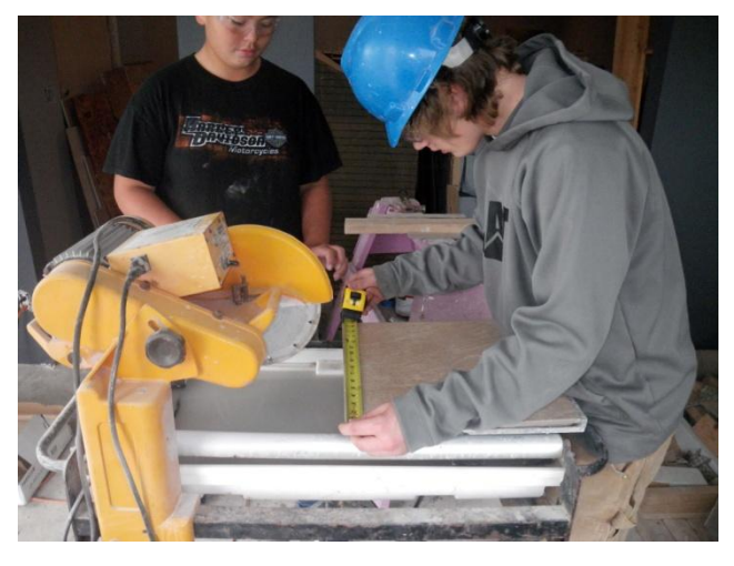
Measuring before cutting the tile.