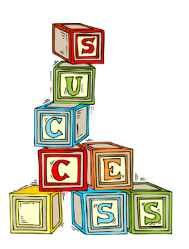
KPBSD – Working to develop productive, responsible citizens who are prepared to be successful in a dynamic world.