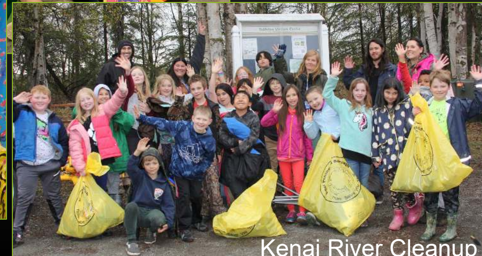
Kenai River Cleanup