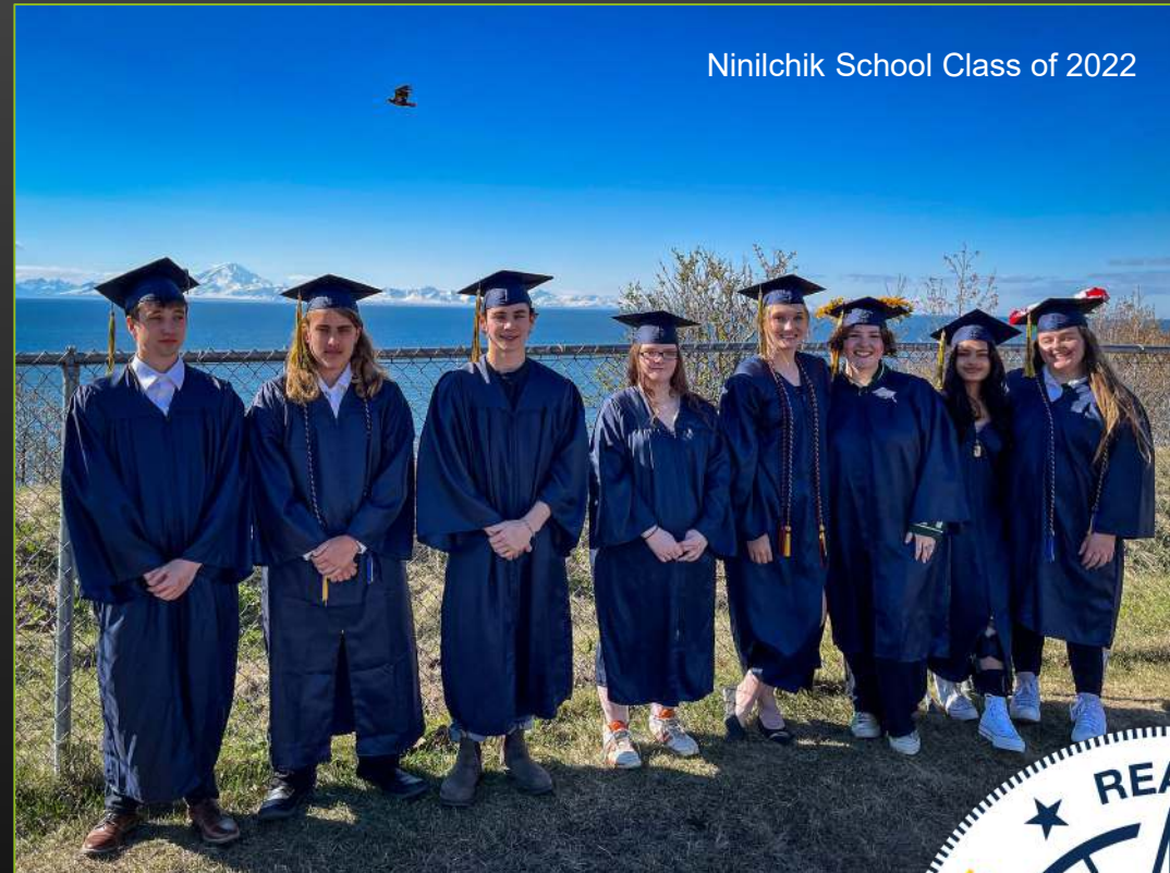
Ninilchik School Class of 2022