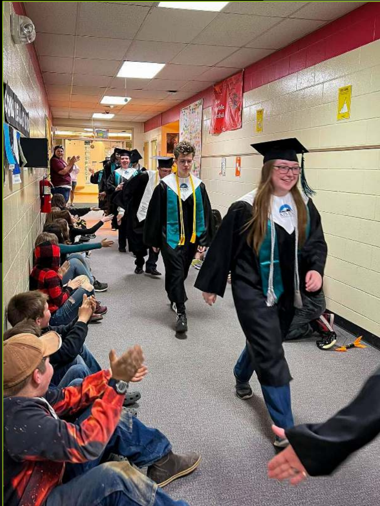
River City Academy Class of 2022 visit Sterling Elementary