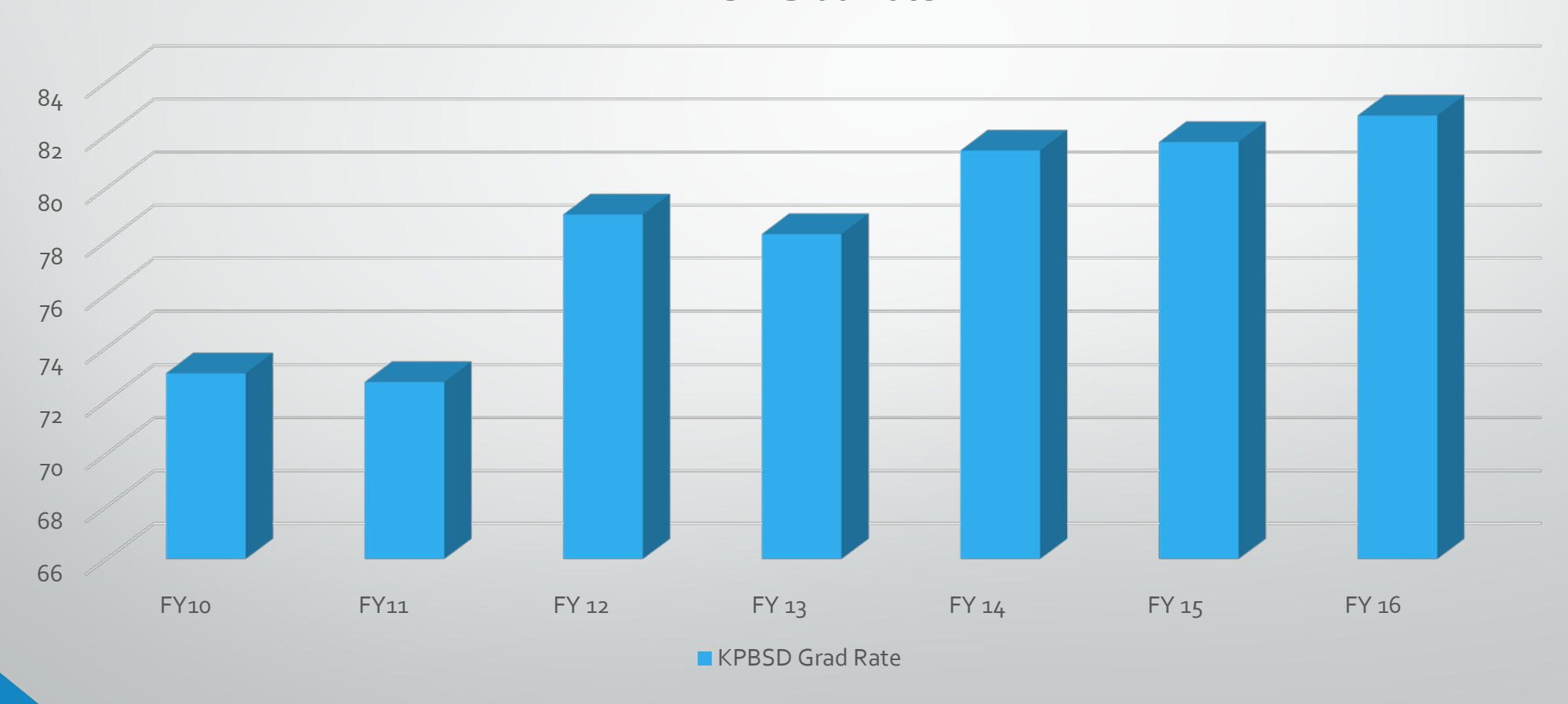
KPBSD Grad Rate